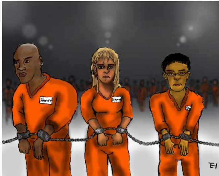
We are all sinners!

LUKAS 18:19 Dá ki Yesus notubag, "Nongonu sin ikow im mogumanbí kon Aku'oi im mopia? Diábí tobatúmai im mopia, kolikudbí ing ki Allah tontaní.